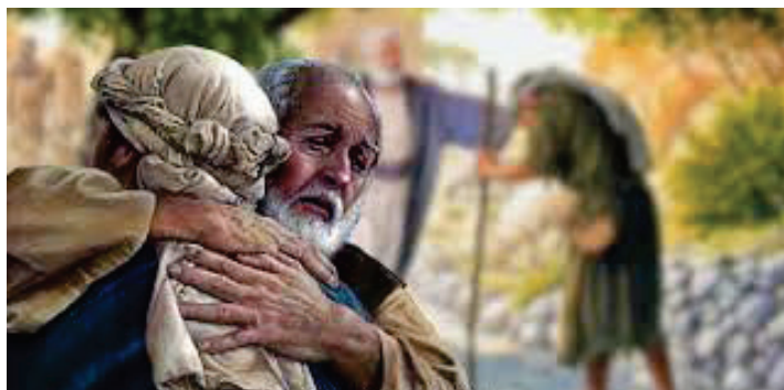
TWENTY-FOURTH WEEK OF ORDINARY TIME

God's loving mercy and forgiveness to us is the central message in Luke's Gospel for the 24th Sunday of Ordinary Time . Knowing that his audience includes not only the sinners but also the judgmental religious leaders, Jesus offers three parables about mercy, ending with the powerful story of the Prodigal Son. The father says to the jealous older son, "You are here with me always; everything I have is yours. But now we must celebrate and rejoice, because your brother was dead and has come to life again; he was lost and has been found."